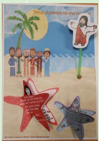
Craft 7.2: Jesus Ascension