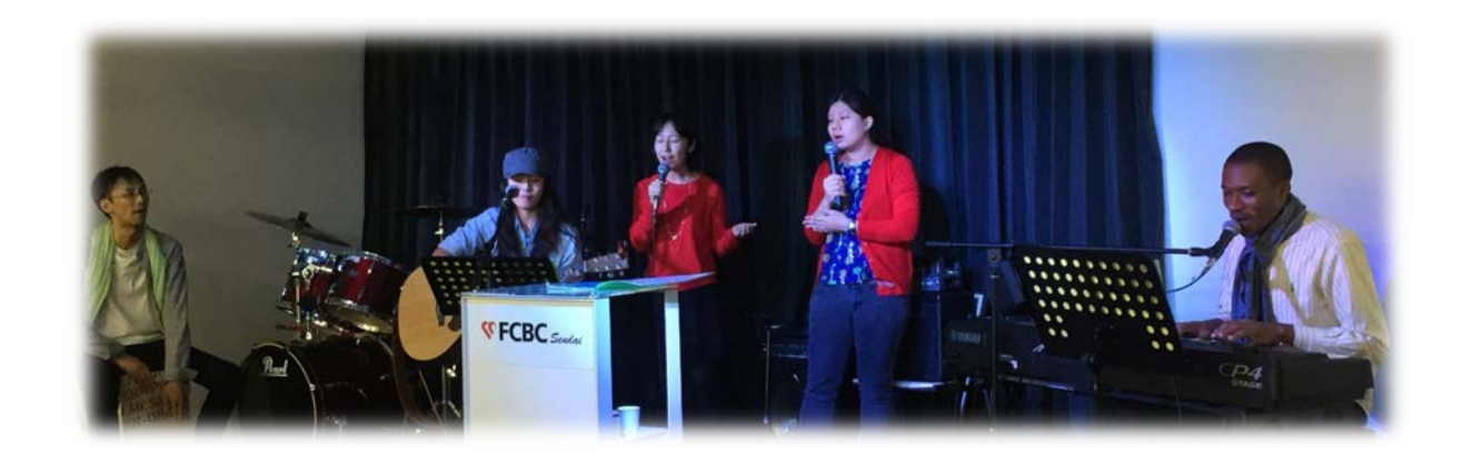
Day 8: 9 Oct 2015

One last day before our grand finale – Singapore Night! After a huge breakfast at a new Japanese breakfast joint with reflection on the previous days' events, the Love Japan Team spent the whole day preparing for Singapore Night. We went out to the supermarket to buy all the ingredients needed and headed home to prepare.