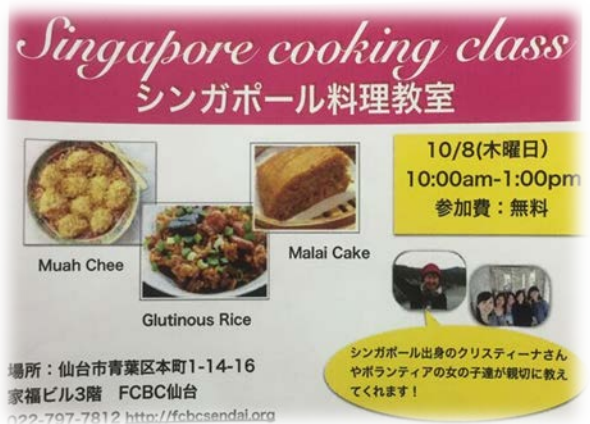
Day 1: 2 Oct 2015

The team met up at Changi Airport Terminal 1 in the early morning 0400H for our flight at 0635H via Delta Airline. We re-organised some of the foodstuff and materials for the programme and re-packed into Sarah's extra luggage. Esther prayed for us before we crossed the immigration.