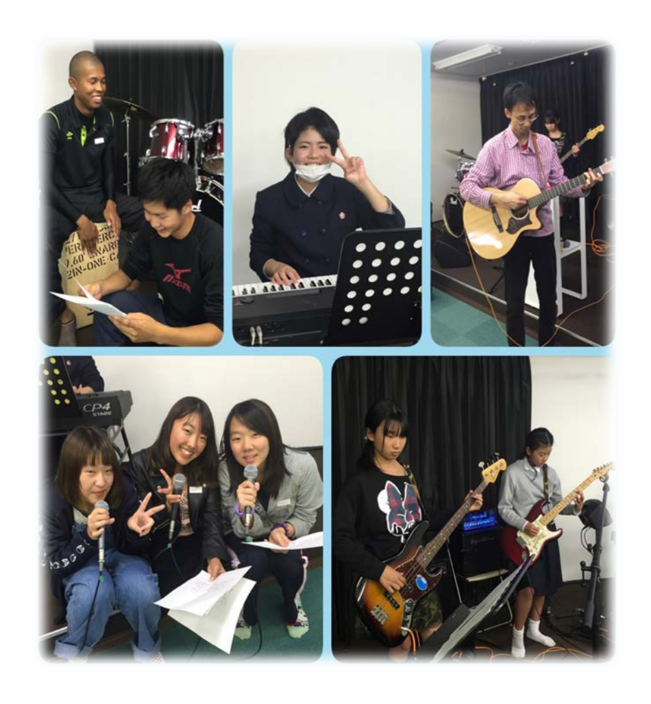
Day 9: 10 Oct 2015