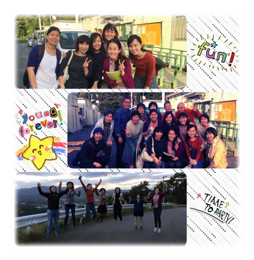
Day 4: 5 Oct 15