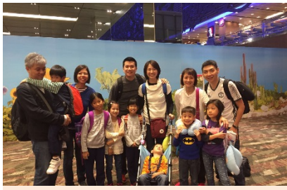
Grateful just to be leaving for Sendai