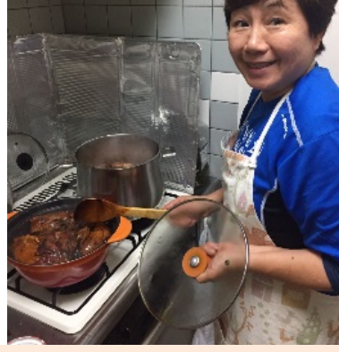
Pastors are always cooking and serving us. We are humbled by their hospitality and love.