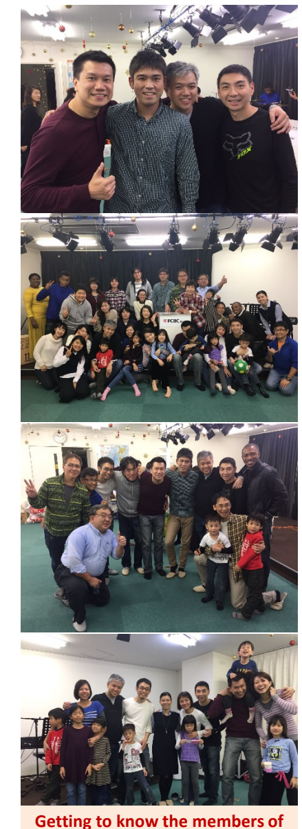
Getting to know the members of FCBC Sendai