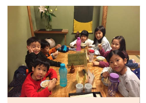
Next generation warriors for Christ