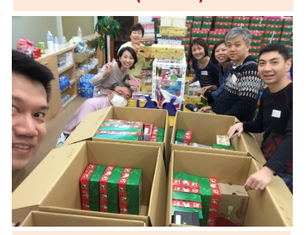
Singaporean competitiveness put to good use. We finished three days of work in one day