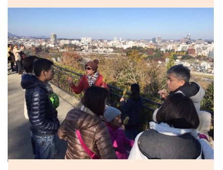
Praying over the city of Sendai on Mt Aoba