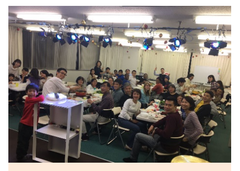
Becoming part of FCBC family