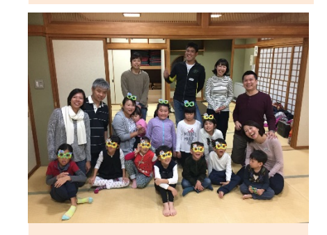
Doing crafts with kids