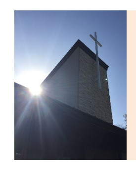
A beautiful church We spent time to pray for the church members, for unity and peace.