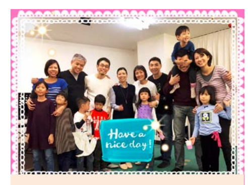
Serving as families