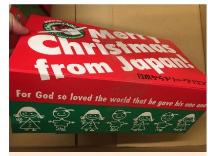
Packing a Gospel Opportunity Box (GO Box)