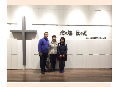
Tohoku Gakuin University Inscription reads: Salt of the Earth, Light of the World