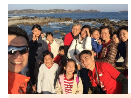
Impromptu meeting with Kesennuma members Besides praying over the city, we had the unique opportunity to minister to the members. A divine opportunity.