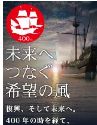
Date sent out “John the Baptist” to seek help after a tsunami 400 years ago