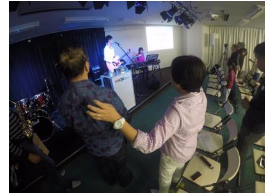
Pastors worshipping during FCBC Sendai service.