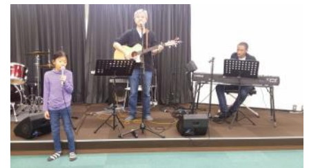
Performing “O Happy Day” with the Lee Band