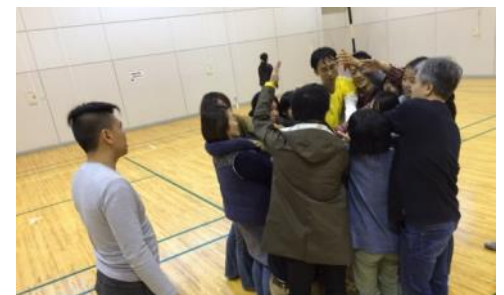
Playing "Disentanglement" but did not quite succeed..