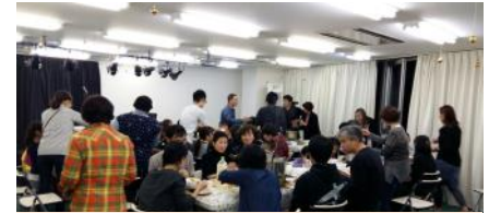
20 new visitors mingling with SG team.