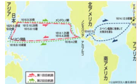
The voyage took many years to complete but failed in its mission.