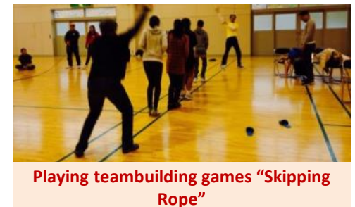
Playing teambuilding games "Skipping Rope"