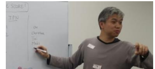
Playing the "Guess the Score" Game!

Watching the game. Score was SGP 0- JPN 3