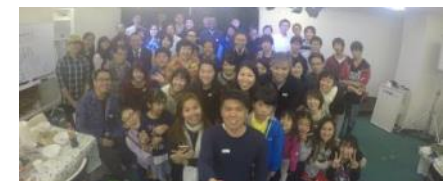
Group shot at the end of Gospel Nite