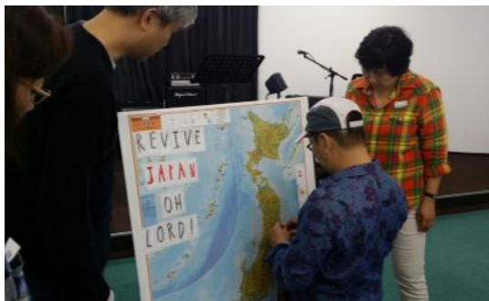
Pastor planting the first pin in the City of Sendai.