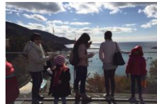
Team overlooking the replica vessel of “John the Baptist”