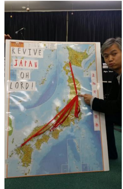
Declaring the revival will spread through Sendai to the 12 largest cities of Japan