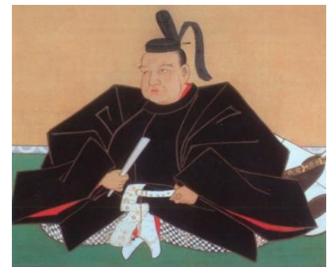
Portrait of Date Masamune