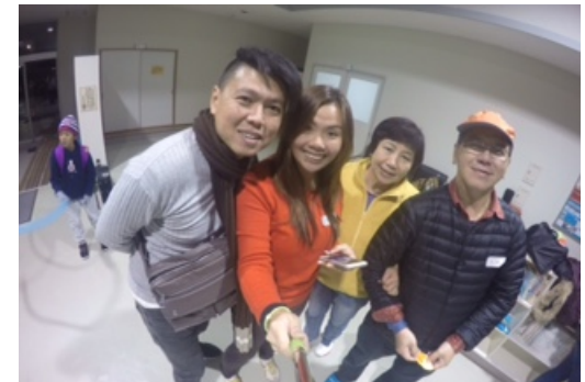
Selfies with our heroes, the Pastors.