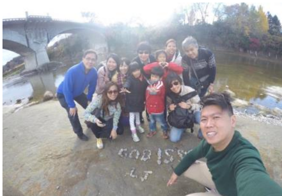
"God is LoveLove Japan"

The martyrs died under the bridge. The river formed a moat surrounding the Sendai castle. Date's stronghold