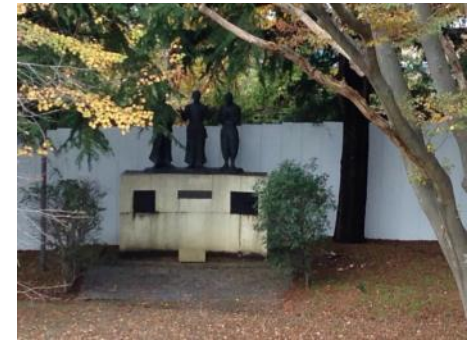
Christian Martyrs Monument