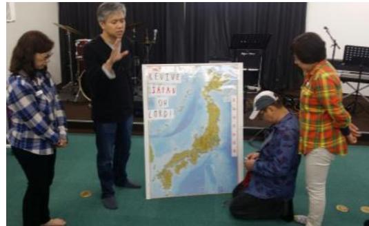
Reaffirming the mission and call over Pastor to bring revival to Japan