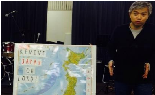
ZX explaining prophetic act to participants