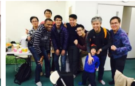
Guys in Japan arise! There is an international flavour in FCBC Sendai. We saw Chinese, Nigerians, Jamaicans, Canadians, Singaporeans and of course Japanese. Many returning Japanese find Christ overseas and return.