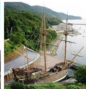
The actual ship “John the Baptist”. One of team members saw a vision of a ship prior to the trip.