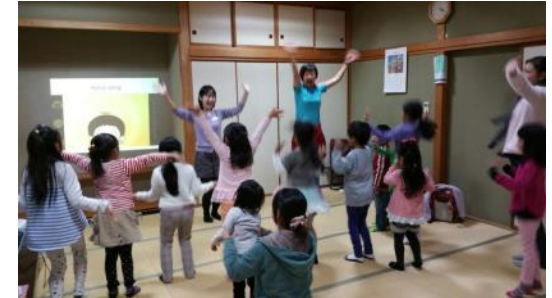
E-Circle, participating with kids in songs