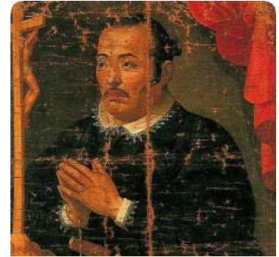
Tsunenaga was baptised while on the trip. May of the 180 envoys converted and were later persecuted for their faith