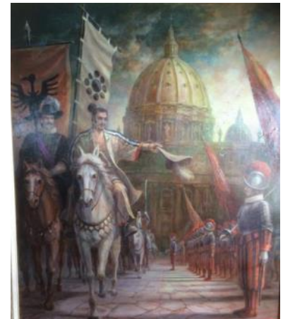
Tsunenaga welcomed in Rome, but did not win the favour of Spain