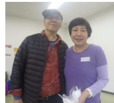
Looking hip and happening always!