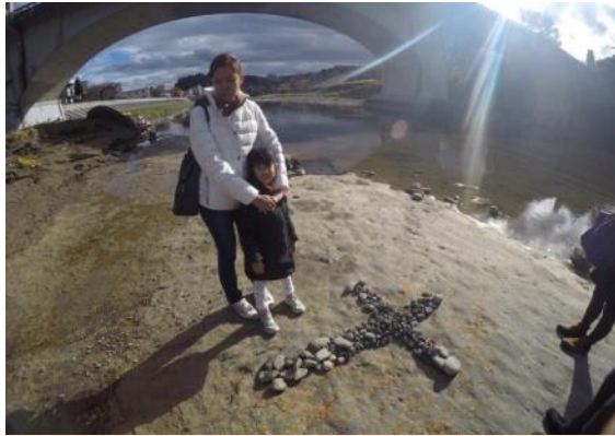
Enlarging a cross we found on the riverbed.

God reminded us that (i) He has not left Japan since the martyrs' death. They shall not die in vain, (ii) We are to continue to build on their work. It is not complete yet. As a prophetic act, we enlarged the cross that we found.