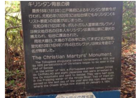
Write up on Monument