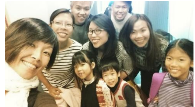
Going in faith despite feeling uncertain about the program at hand, and first time to Japan