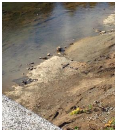
View from the bridge at the enlarged cross.

The kids also formed the words God is Love. Truly he draws near to us even when we are not looking for him. He demonstrates His love in that while we were still sinners, Christ died for us. Rom 5:8