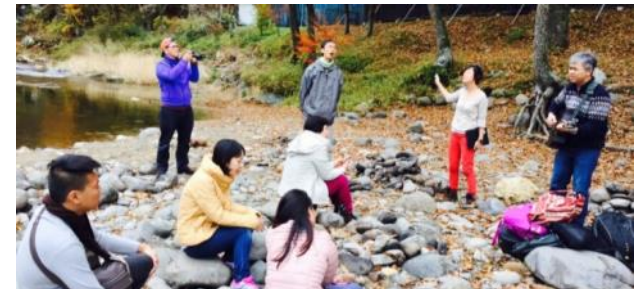
Worshipping God in the open in the cleft of His palm along a river.