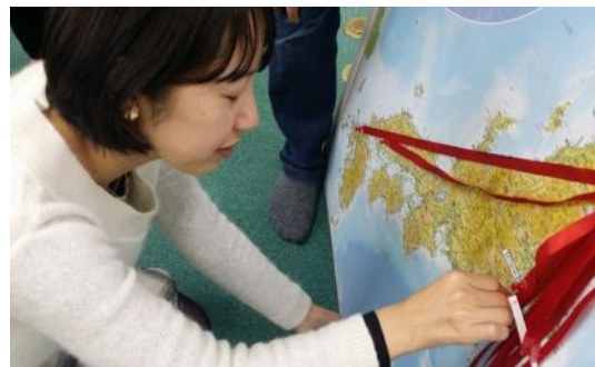
Members connecting 12 cities with Sendai with red ribbon symbolising the blood of the martyrs and the Lamb.