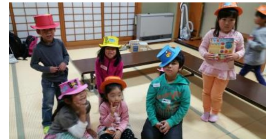
E-Circle, doing crafts with kids