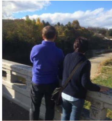
Pastors looking over the river at the cross.

God reminded us that (i) He has not left Japan since the martyrs' death. They shall not die in vain, (ii) We are to continue to build on their work. It is not complete yet. As a prophetic act, we enlarged the cross that we found.